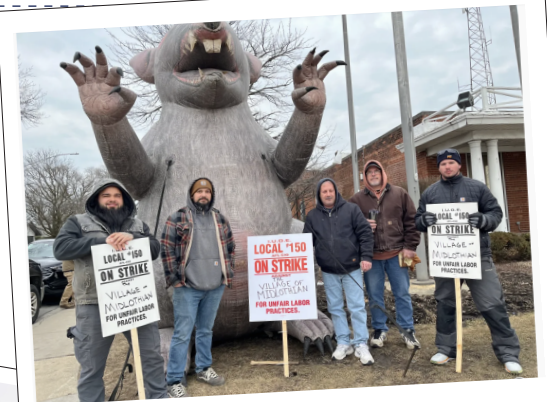
CHICAGO TRIBUNE, MAY 10, 2025